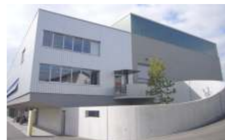
Eisenberg, Plant 2