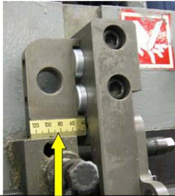
K0.913.712 Magnetic Pre-Setting Gauge for Stop Bolt Position