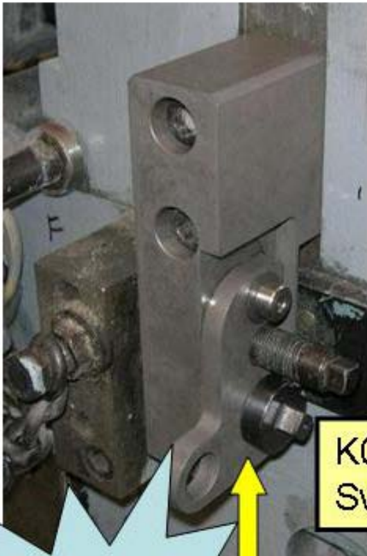
K0.998.495.2 Quick Release Swing Out Shim Plate

Save change time by ELIMINATING the removal of pull bolt during size change!